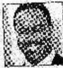
State Representative-District 36 DARON MCGEE